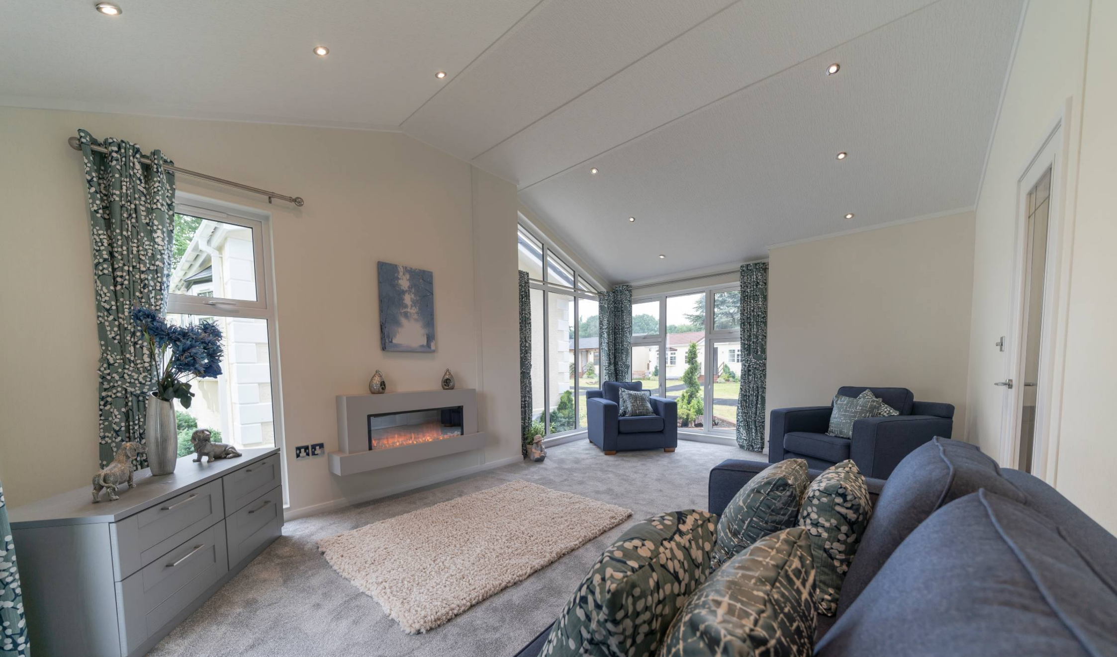
The Wentwood, Nia Roo Retirement Park, Newmachar, AB21 0UG